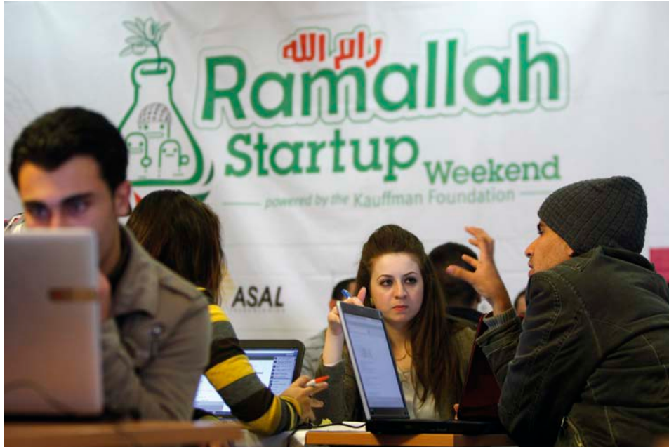
Palestinians programmers attend a Ramallah Startup Weekend workshop in the West Bank city of Ramallah.