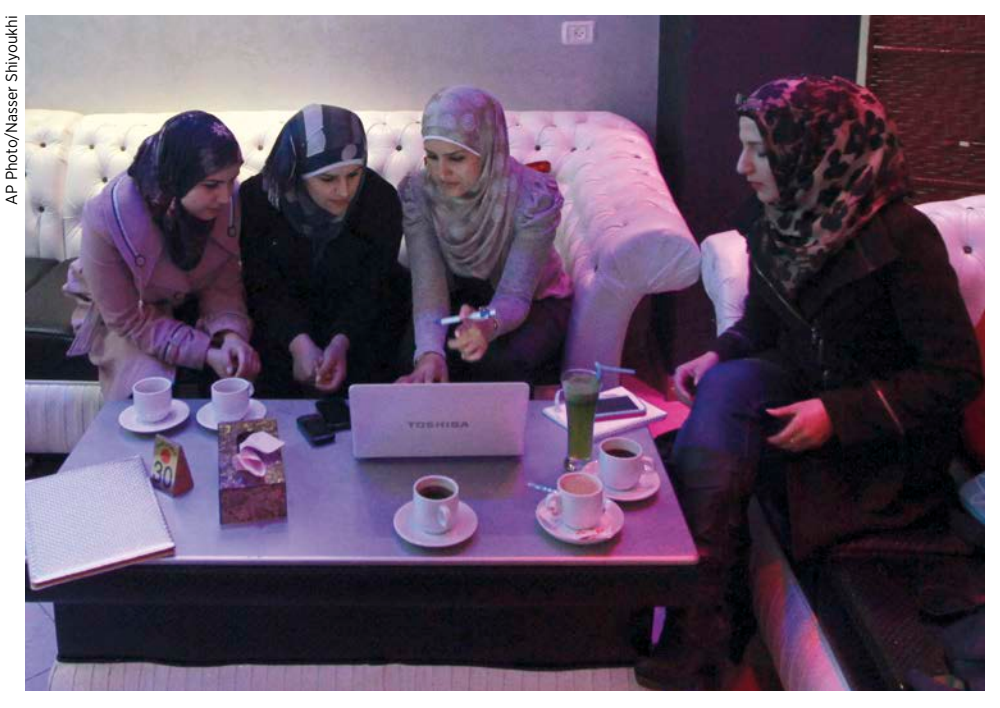
Some of the first female high-tech entrepreneur in the West Bank, talk to other Palestinian women in the village of Dura.

Creating a high-tech economy in the West Bank will not solve the Israeli-Palestinian conflict nor bring peace to the Middle East. That, however, is not our aim. High-tech is a creator of wealth, educational opportunities, and civil society structure. Its growth is intended to improve the standard of living in the West Bank, boost civic engagement, and potentially create a common language of technology between Palestinian and Israeli entrepreneurs. As Israeli and Palestinian authors with significant experience working together across the boundaries of conflict, that is what we aim for.