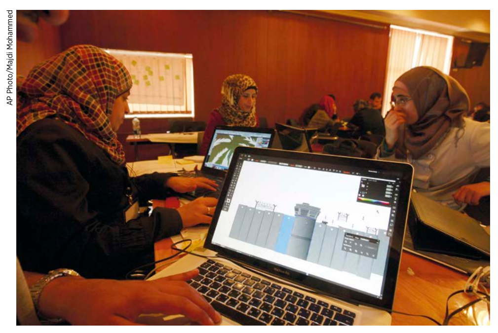
Palestinian programmers attend a Ramallah Startup Weekend workshop in the West Bank city of Ramallah. Local entrepreneurs say their unique circumstances, including years of experience coping with Israeli travel restrictions, have fostered a creative spirit conducive to the entrepreneurial high-tech world.